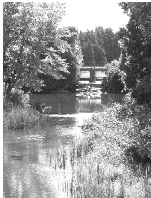
Picturesque dam at the Estonian Campground in Udora built by first Estonian cottagers in 1950s..

and fields were left for the most part untouched, to be enjoyed and managed jointly by the cottagers and the children's camp. A trim and vigorous bunch, they also built an outdoor track and field stadium, that many (an Estonian) claim was one of the best sport venues in Ontario way back in the 50s and early 60s. The Pefferlaw Brook, which runs through Joekaaru, was dammed and a recreational and competitive swimming area was also developed. The dam is still operational, but the water is now a dark morass brimming with a thick unsavoury silt.